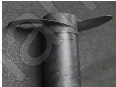
Figure 2 (Lower unit and prop with debris)

CAUTION: DISCONNECT THE MOTOR FROM THE BATTERY BEFORE BEGINNING ANY PROP WORK OR MAINTENANCE.