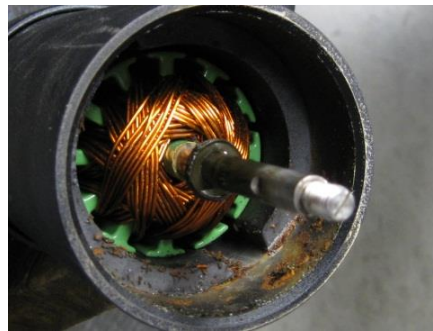
Figure 3 (Water damage to the lower unit)