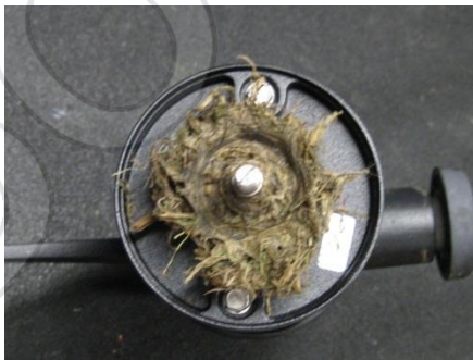
Figure 4 (Weeds caught behind propeller)

NOTE: We recommend removing the prop after every use to check for weeds or fishing line that may be caught behind it (Figure 4). This can result in damage to the seals and allow water into the motor (Figure 3). Debris is not always visible (Figure 2) which is why the prop must be removed to be properly inspected.